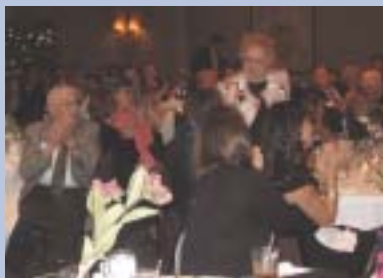
2006 Medallion Dinner

NHCC faculty, staff, alumni and friends attended the 2006 Medallion Dinner, sponsored by the NHCC Foundation at Edinburgh USA. This event was designed to say thank you