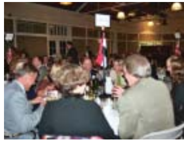
2006 Dinner Auction

The event was attended by 440 guests and raised $70,000 for student scholarships at NHCC. Although the event was "black tie admired", guests and volunteers were encouraged to embrace the theme by donning traditional attire representing different countries of the world. The evening consisted of bidding on over 250 silent and live auction items including many internationally themed baskets, a trip to Fiji, games, a raffle for a 2006 Mustang, dinner, and presentations.